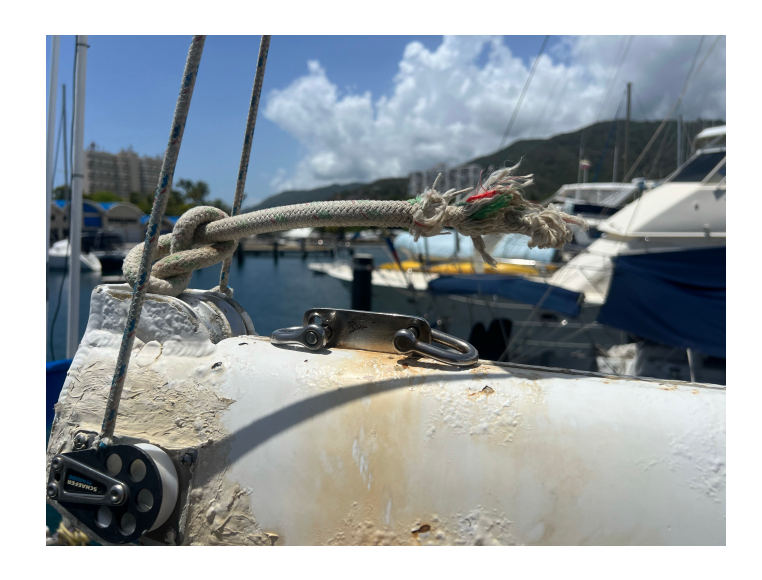
M10Tack Ring Type. Tipo #2