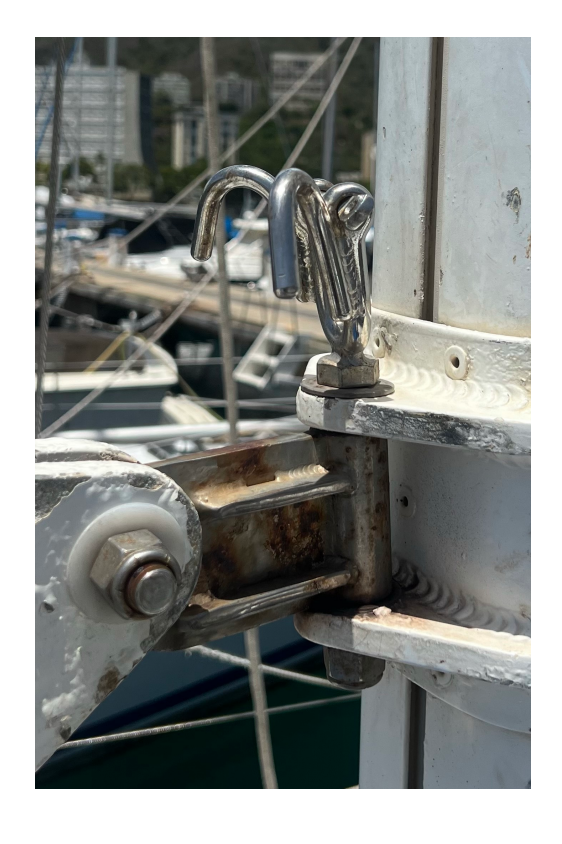
M3 Clew Cut Up (Top of Boom to Center of Tack Pin - X) M4 Clew type (slug, outhaul car or ring with strap

M1 Tack Cut Back (Aft face of Mast to center of tack Pin - A). 5 cms M2 Tack Cut Up (Top of Boom to Center of tack Pin - B). 9 cms