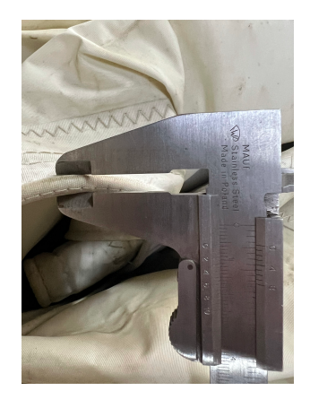
H20 Furler Manufacturer

H31 Draft Stripe Color (red, blue or black) RED