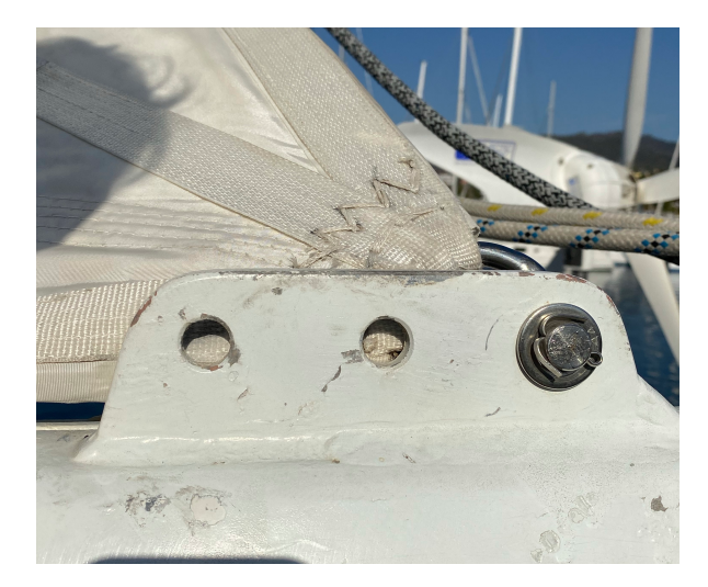
Mainsail Clew Attachment

Take note that our mainsail does NOT have an outhaul. Instead there are three different attachment points to choose from. Currently our mainsail is attached to the furthest aft.