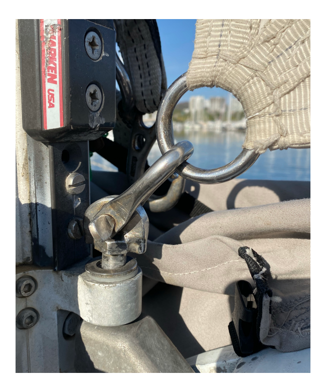
Mainsail Tack and Bottom of Track