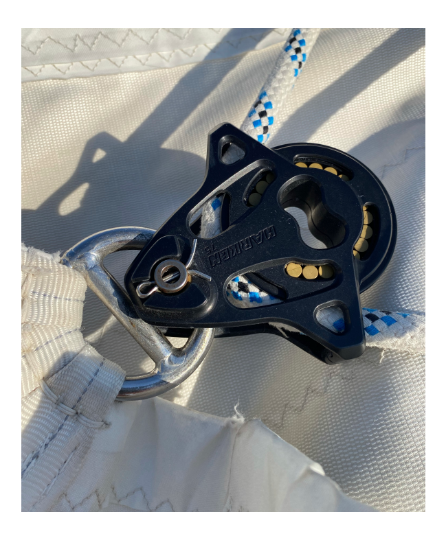
2nd Reef with pulley block

Hope this helps to make more clear what we actually measured.