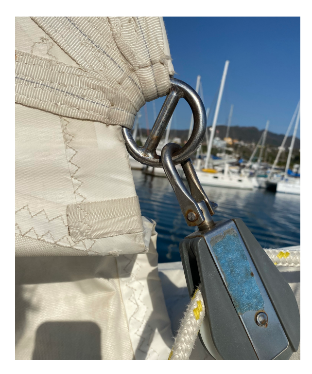
3rd Reef with pulley block