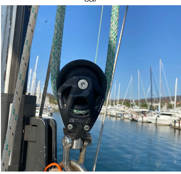
Main Halyard Pulley Block