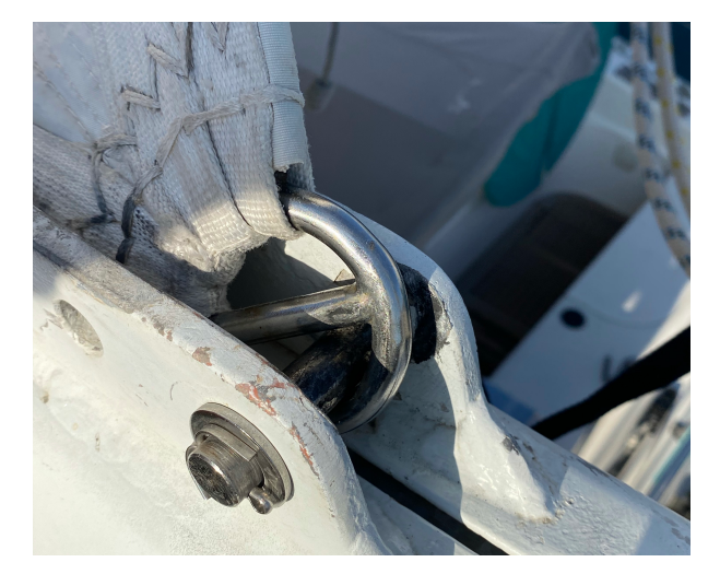
Mainsail Clew Attachment